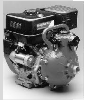
Firefighter Plus™ with a Briggs and Stratton Electric-start "Vanguard" Engine