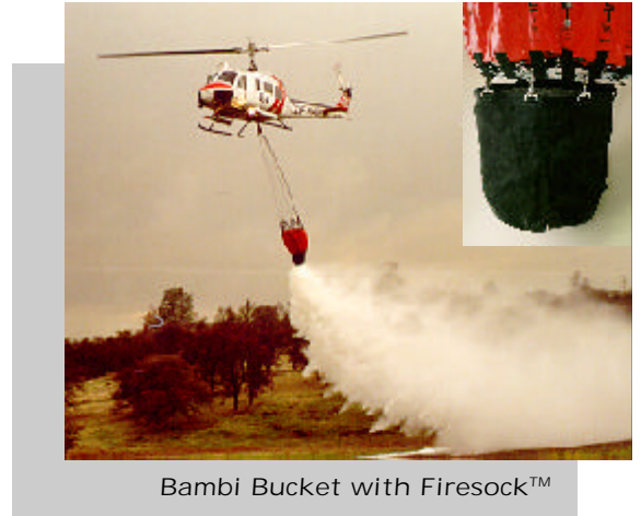
Bambi Bucket with Firesock™